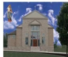
Mission Established 1855 Blessing of the Church Oct 2, 2010 A.D.