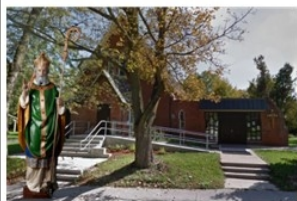
Established in 1876