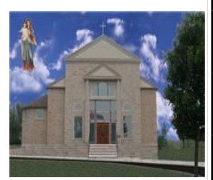
Mission Established 1855 Blessing of the Church Oct 2, 2010 A.D.

St. Mary's Mission: stmarysno.archtoronto.org