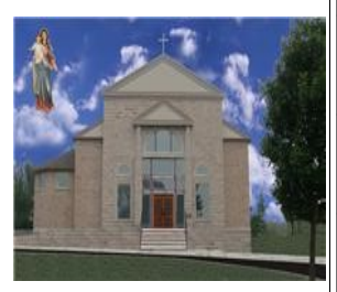
Mission Established 1855 Blessing of the Church October 2, 2010 A.D.