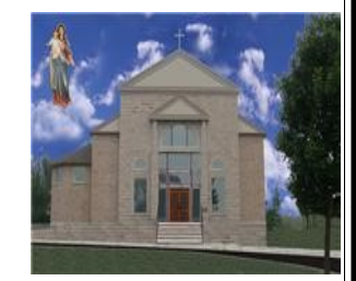
Mission Established 1855 Blessing of the Church October 2, 2010 A.D.