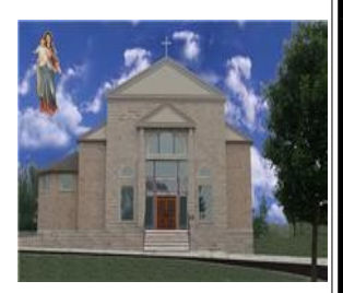
Mission Established 1855 Blessing of the Church October 2, 2010 A.D.